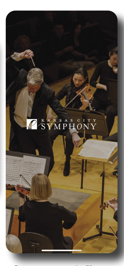
Cover screen on the Kansas City Symphony app.

Visit the app store on your smartphone, AppleTV, AndroidTV, Roku or Amazon Fire and search for "Kansas City Symphony."